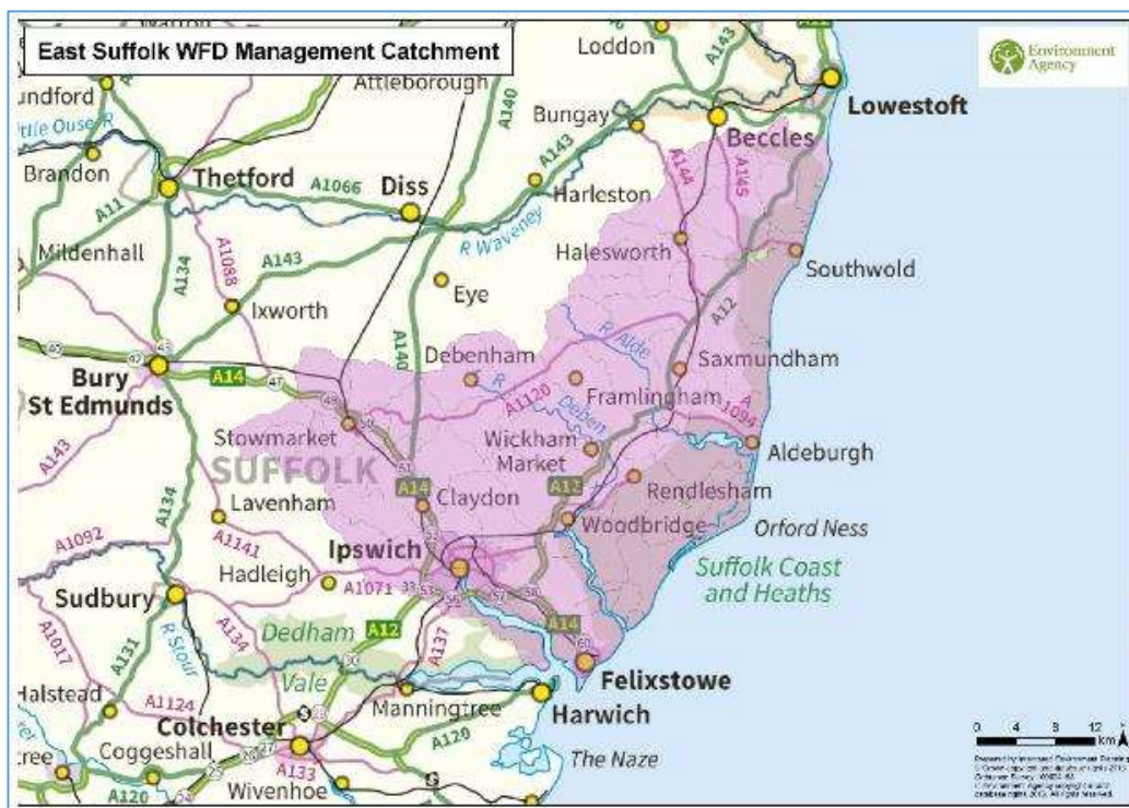
Figure 1 - East Suffolk Catchment Partnership area of operation

Formed in December 2013 the East Suffolk Catchments Partnership covers the river catchments of the Gipping, Deben, Alde, Thorpeness Hundred, Yox, Blyth and Lothingland Hundred.