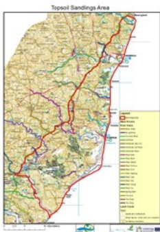
Map Showing the Sandlings Area

Topsoil – Sandlings —This is a three year project that began last year. It aims to improve water availability and the quality of water stored in natural underground reservoirs. This will involve trialing Managed Aquifer Recharge (MAR); abstracting surface water when water levels are high and storing this in aquifers. This stored water can then be abstracted when surface water is low and used to irrigate crops or even transfer it back in to the rivers to improve water levels for ecological benefit. If successful this project demonstrates an alternative to reservoirs, which take land out of production and can offer little ecological value.