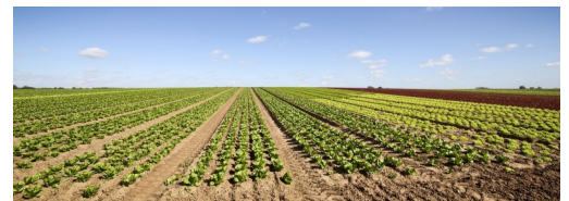
Typical crop for the Sandlings Area

Another element of this project is to improve water quality by working with landowners to reduce soil loss from the land entering waterbodies as sediment. This soil carries substances such as nitrates, phosphates and pesticides into the water environment, which can be damaging to the habitat; also the soil or sediment smother gravels reducing habitats for invertebrates and fish fry. For more information please visit the Essex and Suffolk Rivers Trust Website: