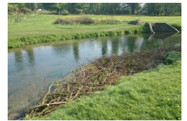
Brush installed in the River Deben to improve flows.

In the Mid Deben 650m of water meadow dyke were restored, reconnections made between the floodplain and the main rivers and improvements to fish and invertebrate refuges. Large woody debris was used to create variation in flow dynamics and improve in-channel habitats. This work took place in the Easton/Hoo area.